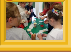
Fundraising For Charity Children in Need