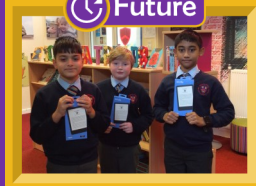
100 Great Reads