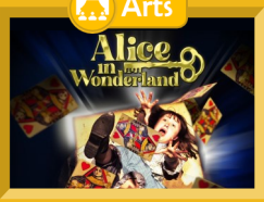
Visit a Theatre New Vic Alice in Wonderland