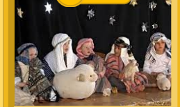
Perform in a Nativity