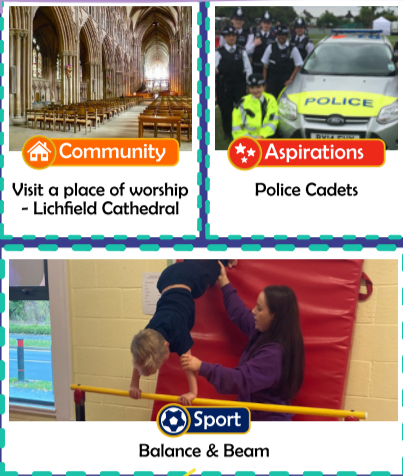
Community Visit a place of worship - Lichfield Cathedral