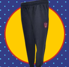
Hempstalls PE Joggers

School Uniform. pre-loved uniform (hempstalls.staffs.sch.uk)