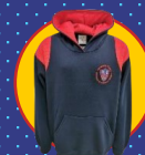
Hempstalls PE Hoodie