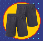
Navy PE Shorts