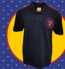
Hempstalls/Navvy PE Polo

Football tops should not be worn as part of the PE kit.