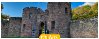
Beeston Castle Trip