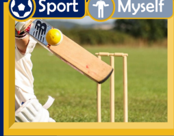
Cricket After School Club