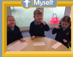
Toothbrushing Activities Early Years

RECEPTION - 14 TH JUNE (FATHER'S/SPECIAL PERSON DAY SESSION)