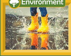
Splashing in Puddles