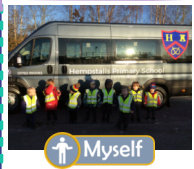
Travel on a Minibus