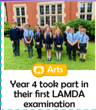
Arts Year 4 took part in their first LAMDA examination