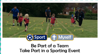
Sport Myself Be Part of a Team Take Part in a Sporting Event