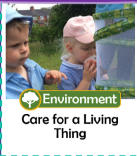
Environment Care for a Living Thing