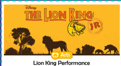
Arts Lion King Performance