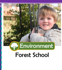
Environment Forest School