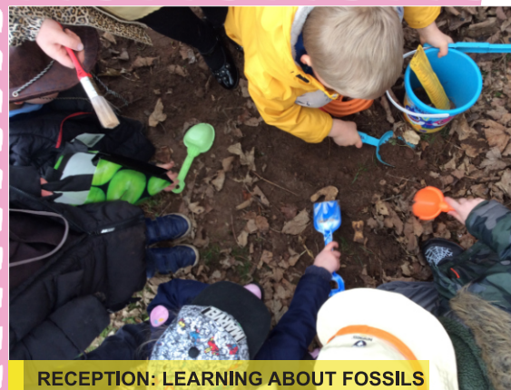
RECEPTION: LEARNING ABOUT FOSSILS

Our vibrant and nurturing Reception setting welcomes children who are 4 and 5 years old. Children will be offered the opportunity to take part in a weekly swimming session to build water confidence and begin to push and glide through the water. Children in Reception will also be able to enjoy sessions in our Forest School where they can explore the outdoors, build shelters and even cook marshmallows on the open fire. Our Autumn Term Reception Sleepover is always very popular!