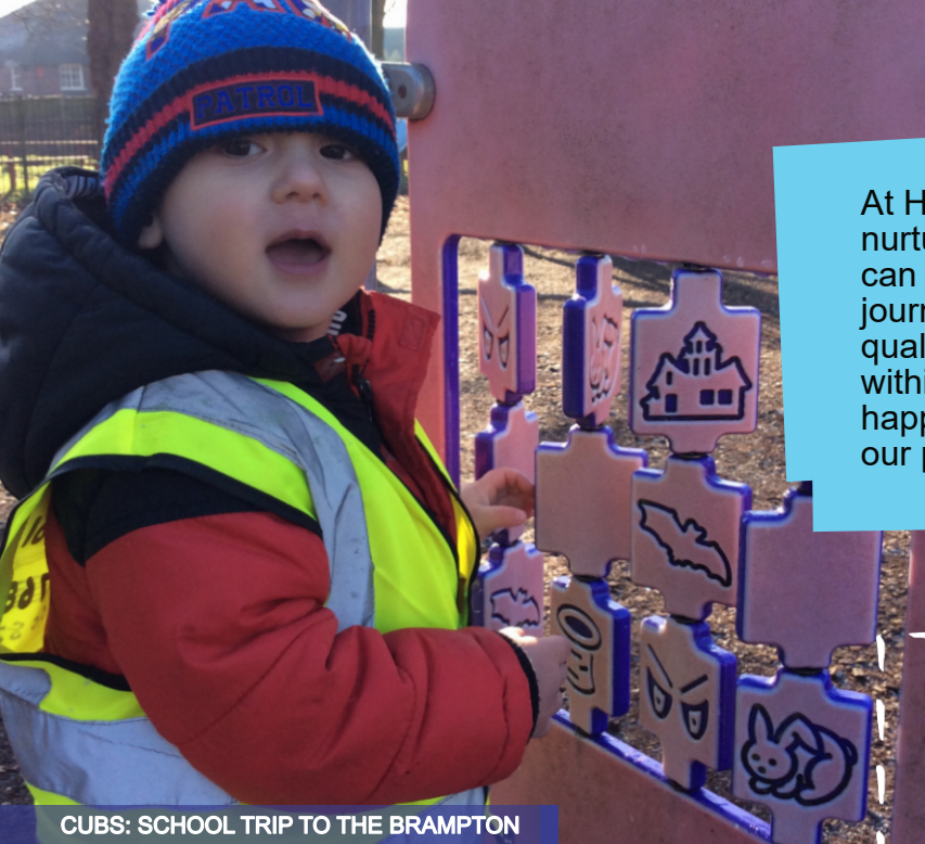
CUBS: SCHOOL TRIP TO THE BRAMPTON

At Hempstalls, we provide our children with a nurturing and safe environment where children can form the foundations for their educational journey. We pride ourselves on providing high quality care to ensure that children settle quickly within their new environment and feel safe and happy. Children's well-being and happiness is our priority.