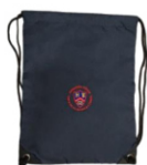
Hempstalls Swimming Bag OPTIONAL