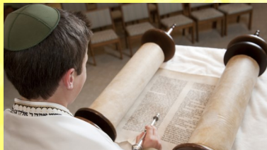
A Jewish Torah