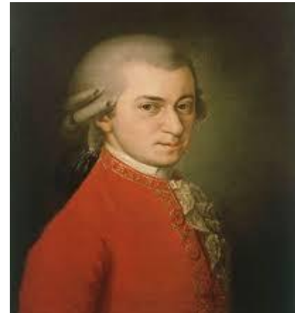
Wolfgang Mozart Classical Period

Wolfgang Mozart was an Austrian composer in the classical period . He famously wrote the piano piece 'Rondo alla Turca'.